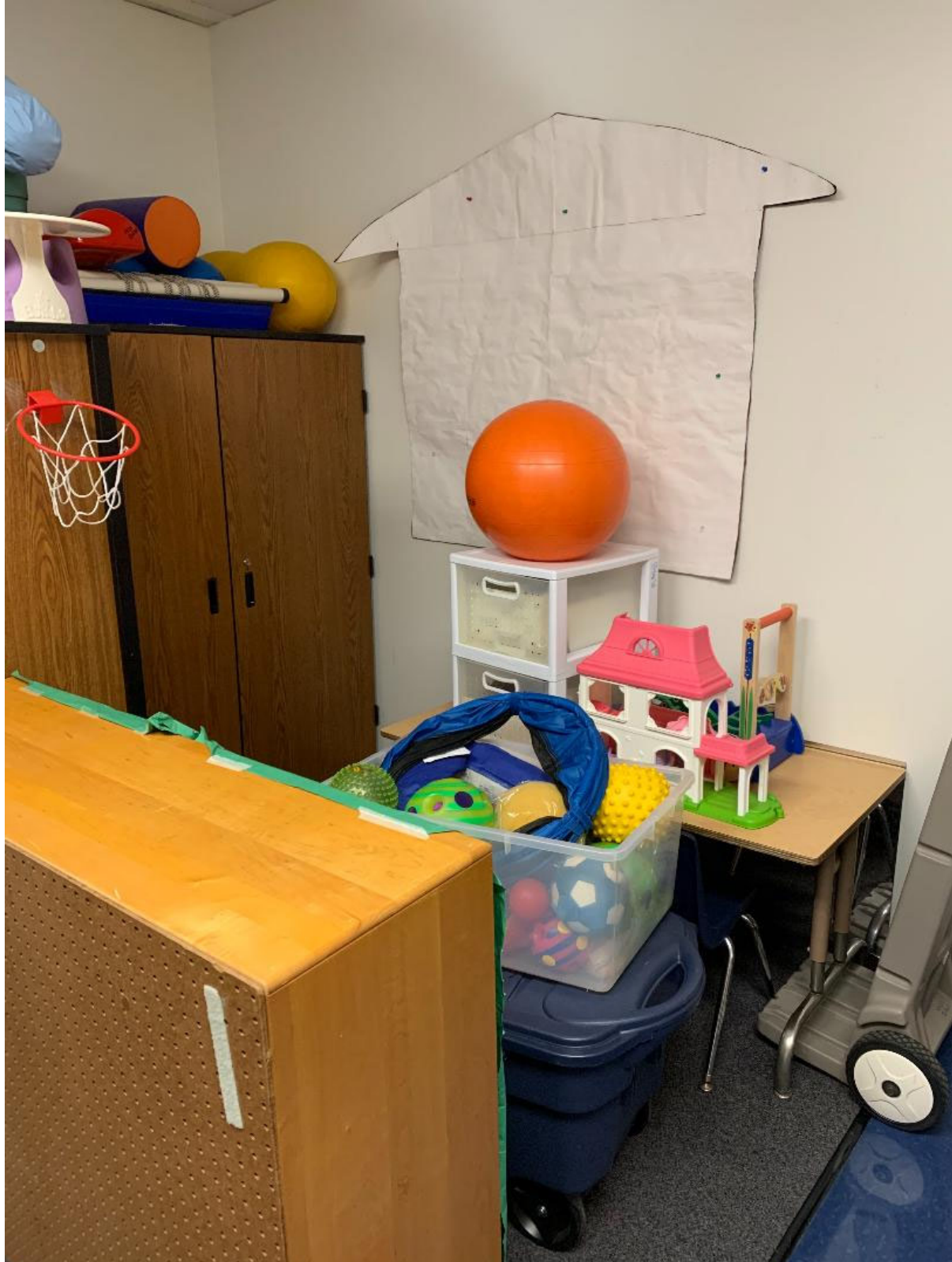
Therapy/testing space utilized by SPED staff at the EIC ATLAS - also a storage room with inadequate space and ventilation.